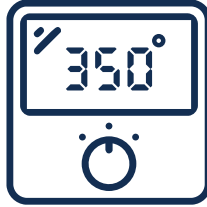
Manual Thermostat & Auto Cut off